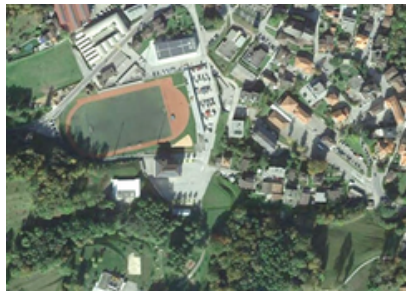
Arena Innovation Community