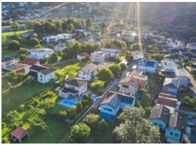
Lugaggia Innovation Community