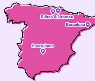
Virtual Green H2 Federation Spain

each represented by a federation of energy communities.